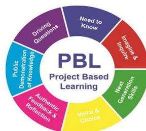
Figure 2. PBL Model

the types of communicative situations that personnel are likely to encounter. Through TBL, learners not only improve their language skills but also develop critical thinking and problem-solving abilities, which are indispensable in operational settings (Viriya, 2018).