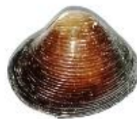
1-rasm. Corbicula cor (Lamarck, 1818) Quyi Amudaryo suv havzalaridan terilgan.

Tarqalishi. Old Osiyo turi bo'lib Markaziy Osiyo suv ekotizimlarida ham tarqalganligi o'rganilgan. Quyi Amudaryo xududidagi Amudaryoda, Dovutko'l, Mejdureche ko'li, Sudoche-Karateren ko'llar tizimi, Mo'ynoq qo'ltig'i ko'li, Sariqamish ko'li. Akushpa ko'li va Shovot. Toshsoqa , Qilichniyozboy, Urgencharna, Qizketgan, Kegeyli , Paxtaarna kanallarida tarqalganligi aniqlandi (1-rasm).